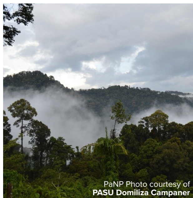
PaNP Photo courtesy of PASU Domiliza Campaner

Ecosystem services assessments were found to be disposed towards resource use assessment and recreation services. The narrow breadth of ecosystem services assessment indicates limited capacity at the protected area level. Studies on valuation of ecosystem services reveal a similar picture to that for ecosystem services assessment: although available tools and methods have expanded and have become more refined, only a handful of studies undertake reliable valuation of environmental or ecosystem services. In terms of coverage, Tubbataha Reefs National Marine Park (TRNMP) and Mount Kanlaon Natural Park receive the most studies. Valuation studies in other protected areas are focused on provisioning services as well as recreation and tourism. The studies mostly