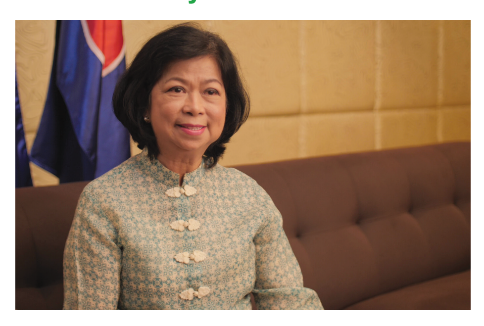
"...the ASEAN Biodiversity Heroes Award creates fertile ground where inspiration can take root and prod other individuals to also act as heroes and initiate wider public involvement within the ASEAN community"

She added, "It is fitting that this recognition comes at a time when ASEAN itself is celebrating its 50th Anniversary. This landmark year not only calls for us to look back at the gains of the last half-century, but also forces us to examine the course of our present actions and their consequences on future generations. In the same spirit of introspective