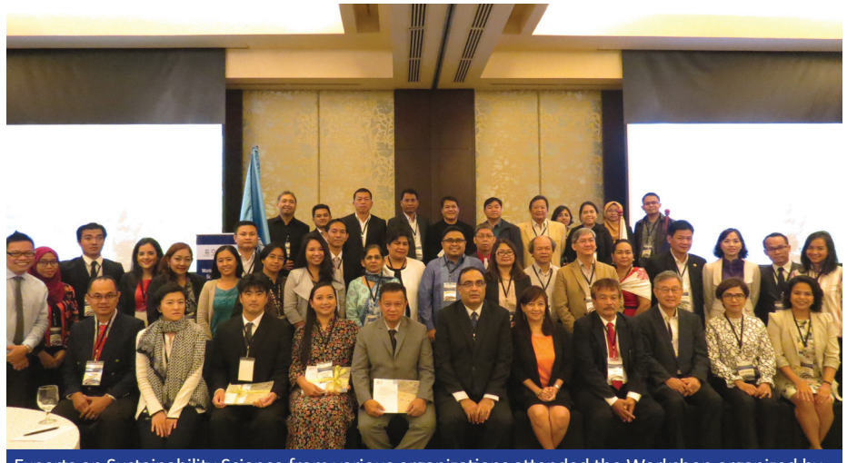
Experts on Sustainability Science from various organizations attended the Workshop organized by ACB and UNESCO

In order to integrate sustainability science approach in the management of ASEAN Heritage Parks (AHPs) and UNESCO Designated Sites, the ASEAN Centre for Biodiversity (ACB) and the United Nations Educational, Scientific and Cultural Organization (UNESCO) held a workshop entitled "Strengthening Science-Policy-Society Interface for Implementing Sustainability Science for Biodiversity Conservation in ASEAN and Asia Pacific Region" on 19-20 June 2017 at the Crimson Hotel, Filinvest City, Manila, Philippines.