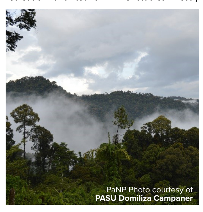
Figure 1: Pasonanca Natural Park, Zamboanga City, Western Mindanao Region

Ecosystem services assessments were found to be disposed towards resource use assessment and recreation services. The narrow breadth of ecosystem services assessment indicates limited capacity at the protected area level. Studies on valuation of ecosystem services reveal a similar picture to that for ecosystem services assessment: although available tools and methods have expanded and have become more refined, only a handful of studies undertake reliable valuation of environmental or ecosystem services. In terms of coverage, Tubbataha Reefs National Marine Park (TRNMP) and Mount Kanlaon Natural Park receive the most studies. Valuation studies in other protected areas are focused on provisioning services as well as recreation and tourism. The studies mostly